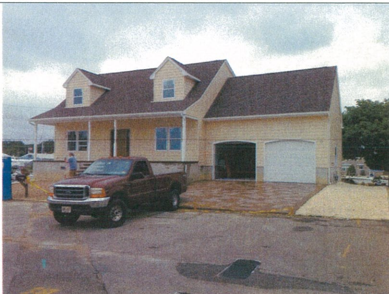
22 One Eye Way, Front, 8/22/14

If using the Elevation Certificate to obtain NFIP flood insurance, affix at least 2 building photographs below according to the instructions for Item A6. Identify all photographs with date taken; "Front View" and "Rear View"; and, if required, "Right Side View" and "Left Side View." When applicable, photographs must show the foundation with representative examples of the flood openings or vents, as indicated in Section A8. If submitting more photographs than will fit on this page, use the Continuation Page.