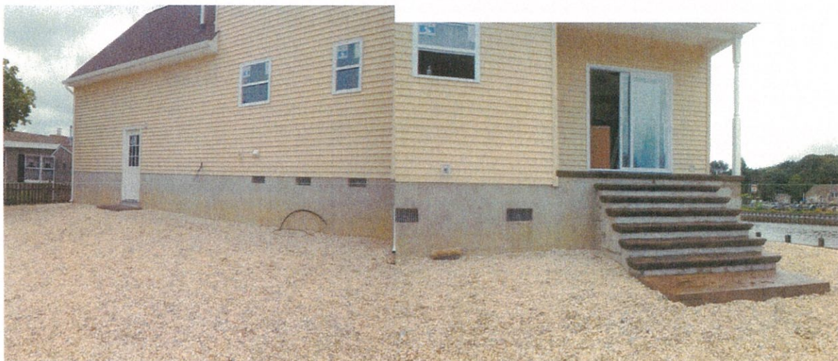
22 One Eye Way, Rear, 8/22/14