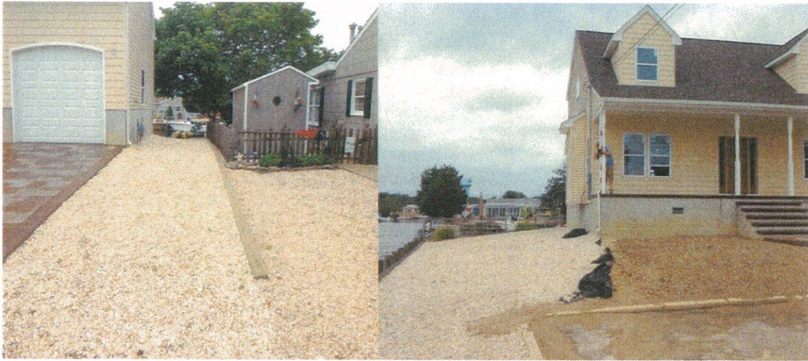
22 One Eye Way, Right side/Left side, 8/22/14