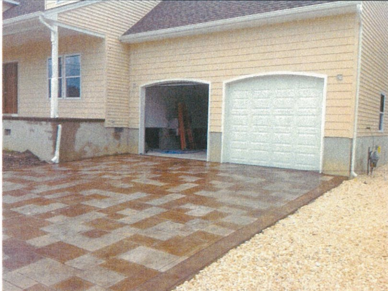
22 One Eye Way, Garage & duct work above crawlspace, 8/22/14

If submitting more photographs than will fit on the preceding page, affix the additional photographs below. Identify all photographs with: date taken; "Front View" and "Rear View"; and, if required, "Right Side View" and "Left Side View." When applicable, photographs must show the foundation with representative examples of the flood openings or vents, as indicated in Section A8.